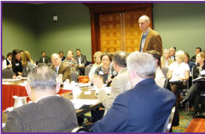
Joint Beef Safety Committee