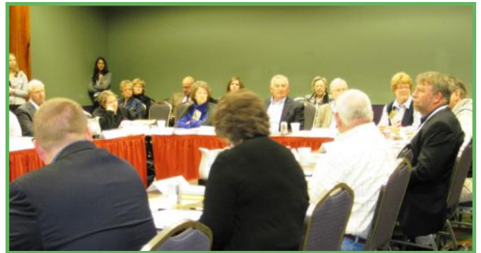
Joint Human Nutrition Committee