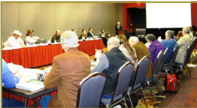
Joint Producer Education Committee