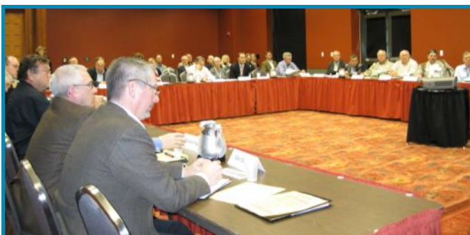
Joint Product Enhancement Committee