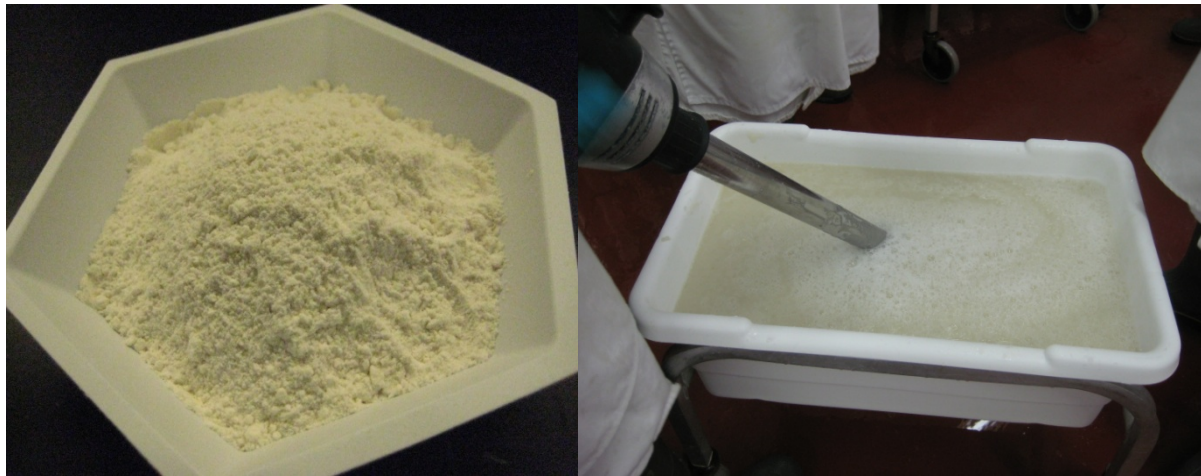
Beef-based water binding ingredient (DBP)

Results from this project give processors tools to create lower sodium and/or cleaner-labeled, brine-injected fresh beef products.