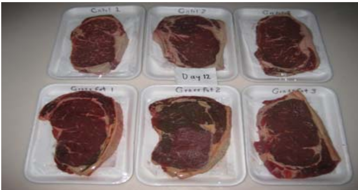
Steaks obtained from grain- and grass-fed animals (day 12 at 1 °C in PVC packaging). Notice the significantly darker color of the steaks from the grass-fed animals (bottom).