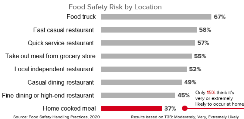
Source: Food Safety Handling Practices, 2020

The research also shows that only 15% of consumers think they are very or extremely likely to get sick from food cooked at home—compared to