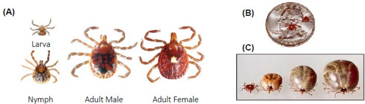
Figure 2. (A) Lone Star tick life stages. The iridescent, solitary white spot on its dorsal surface is a marking that distinguishes adult, female Lone Star ticks from other tick species. Representative images of larval, nymphal and adult male Lone Star ticks are also presented. Photo, URI TickEncounter Resource Center, with permission. (B) Size comparison of Lone Star tick life stages. A nymph, unfed adult female and unfed adult male tick are shown relative to a quarter (from left to right). Photo, SCS, Ltd., tickinfo.com, with permission. (C) Unfed, partially fed and engorged female Lone Star ticks are shown. Note that the solitary white spot remains visible. Photo, SCS, Ltd., tickinfo.com, with permission.

Copyright © Cattlemen's Beef Board and National Cattlemen's Beef Association. All rights reserved.