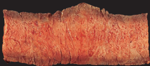
MEDIUM RARE Approximatley 145°F, 63°C