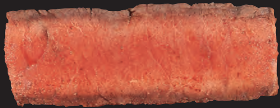
RARE Approximatley 140°F, 60°C