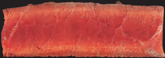
VERY RARE Approximatley 130°F, 55°C