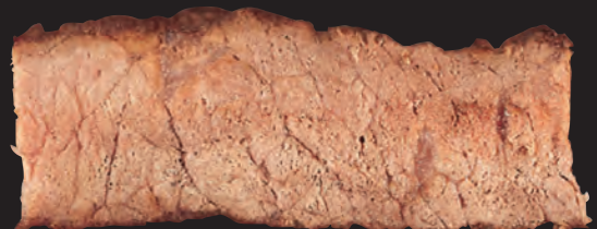
VERY WELL DONE Approximatley 180°F, 82°C