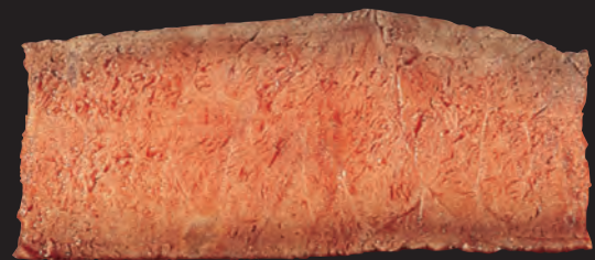
MEDIUM Approximatley 160°F, 71°C