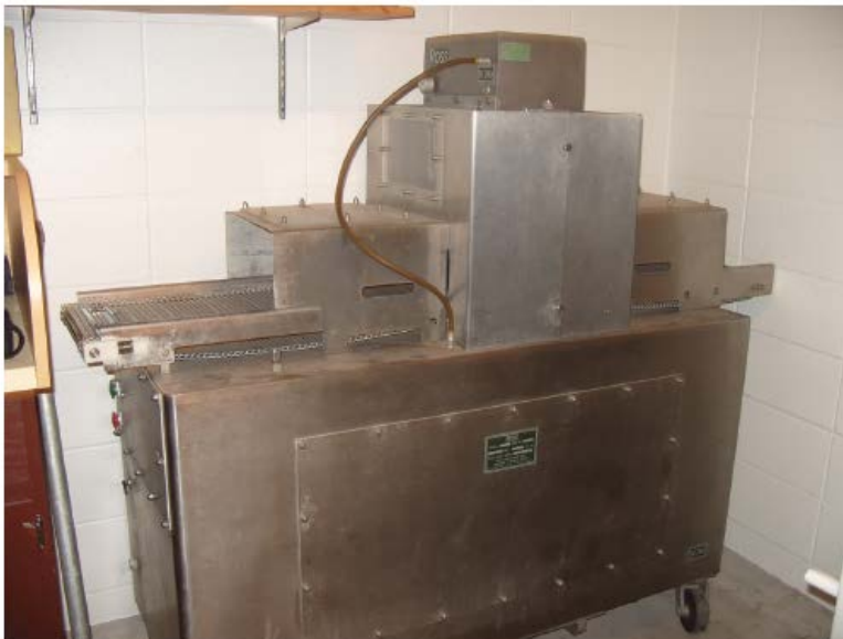
Figure 3. A commercial meat tenderizer.

Needle tenderization of subprimals usually occurs at the processing plant or meat distributor (purveyor) level. The type of equipment used to needle tenderize large cuts is generally large and expensive. Figure 3 shows an example of a needle tenderizing machine. Questions that need be answered about needle tenderization are: 1) What cuts should be needle tenderized; 2) When should a cut be tenderized; 3) What is the proper procedure for mechanically tenderizing beef cuts; and 4) Are there any quality problems that arise from needle tenderization? Each of these questions have been answered through research and industry experience.